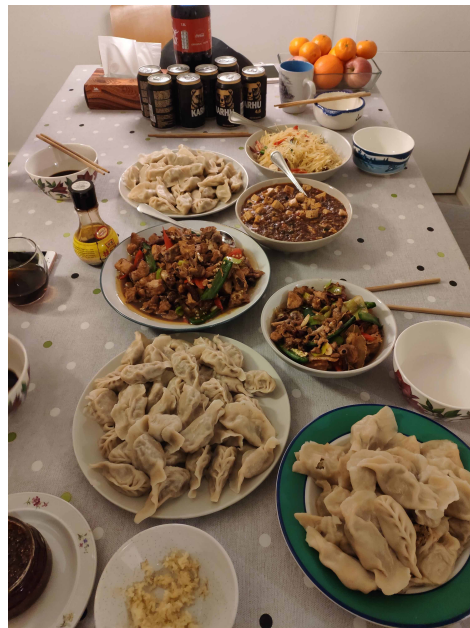
Chinese New Year celebration food with Han