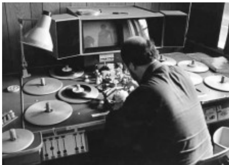
Fig 2. A Flatbed Editor.