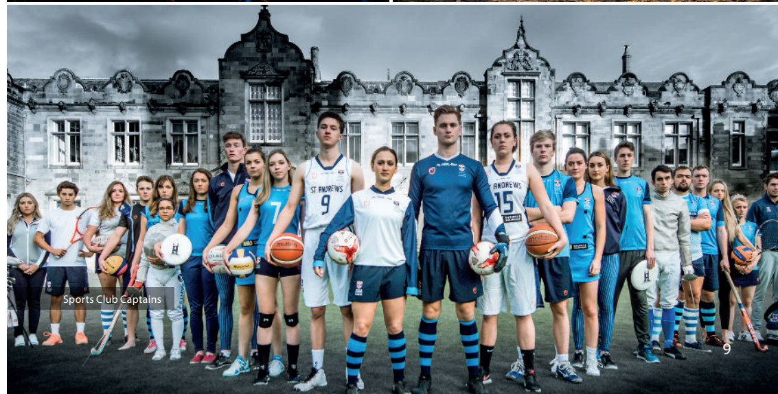
Sports Club Captains