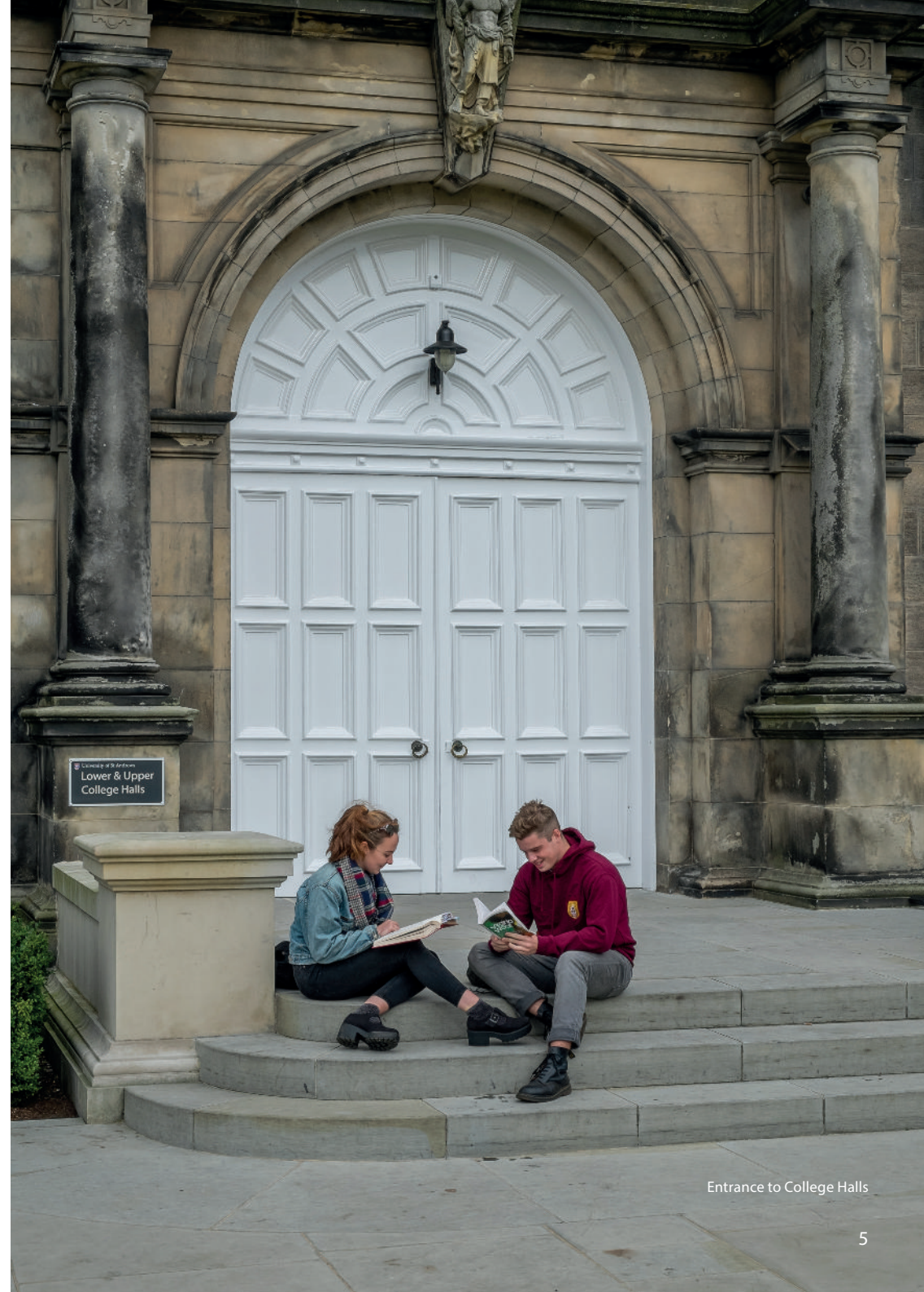
Entrance to College Halls

Students who meet the minimum English language entry requirement, and who would like to boost their English language skills , should consider attending a pre-sessional English language course: www.st-andrews.ac.uk/international-education/short-courses/pre-sessional