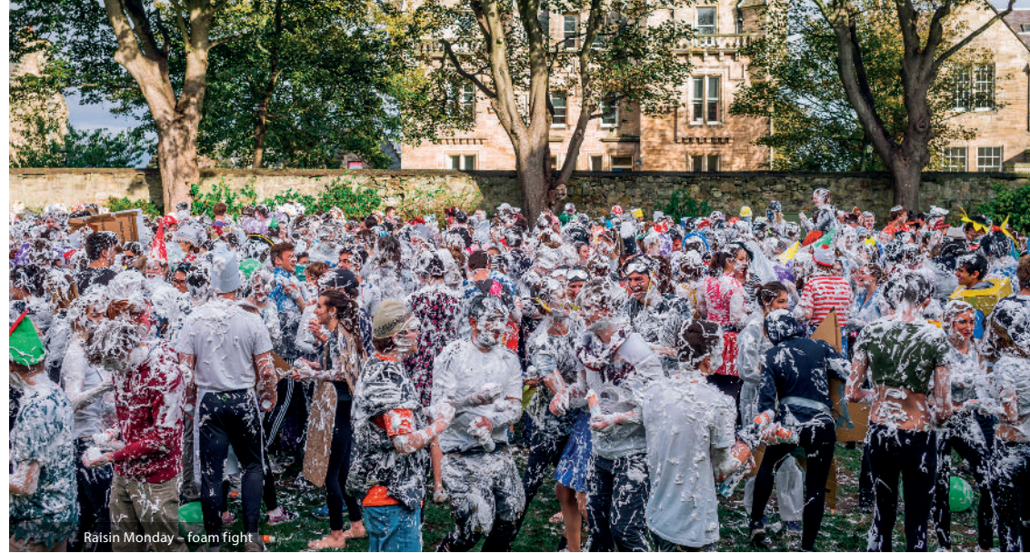
Raisin Monday – foam fight